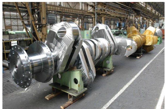
Fig. 2. Crankshaft fabricated by steel

In general, cast iron is a material with low tensile strength, high brilliance. Xementite is a hard and brittle phase, its presence in large amounts and concentrated in cast iron makes it easy to crack under the effect of pulling load, white cast iron has low tensile strength and high brilliance.