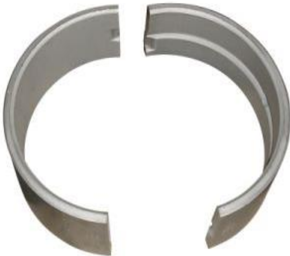
Fig. 3. Bearing of crankshaft based on BSn5Zn5Pb5

Tin tongue: As stated, the slippery tin is a soft material that is solid and solid. The advantage of tin can is that it undergoes great pressure and has a higher ring speed than the gray cast iron, which often makes important slides. Can be used with the numbers BSn10V1 and BSn8Pb12. In practice it is often used with complex tins to make the lining required to resist abrasion and less friction. For the silver lining of the neck and the neck of the crankshaft, the BSn5Zn5Pb5 (in casting state) and BSn4Zn4Pb2.5 (in the deformed state) are used. Solid particles, in the form of individual particles, reduce friction.